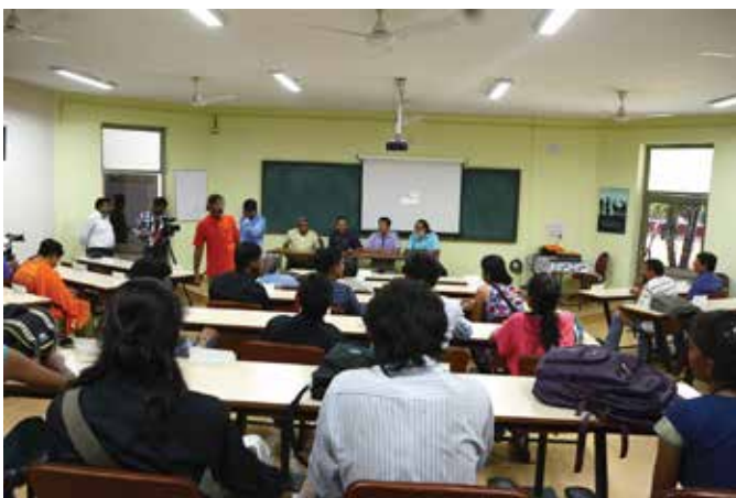
Conducted 3 days Workshop on Liberal Arts (CHARUSAT, Changa)