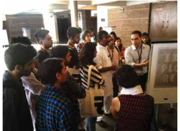
Attendance in Typography Day, 2016 (Srishti Institute of Art, Design & Technology, Bengaluru)