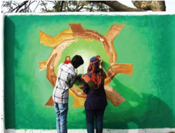
Public Place Wall Paintings (A.V. Road, Vallabh Vidyanagar, Anand)